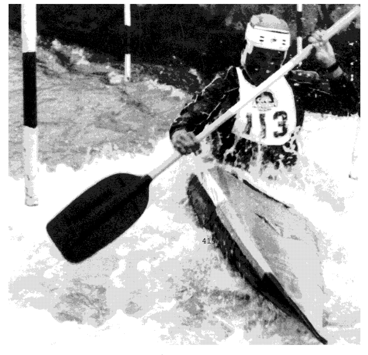
Speed through precision is Fox's formula for success, not just precision in the gates, but precision in all aspects of his training.